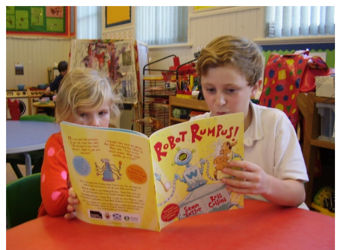
Robot Rumpus was the overwhelming favourite.

During Scottish Book Week all P1 pupils were gifted their Book Bug Bag, which contained the three books.